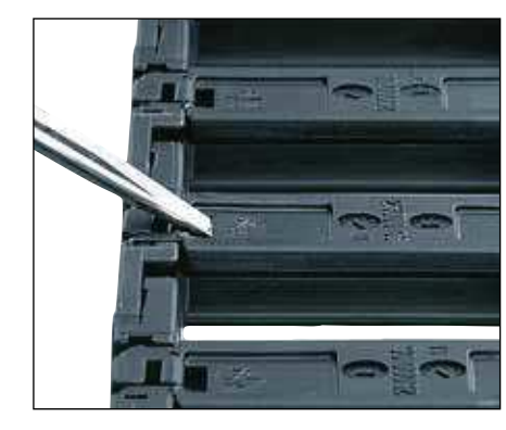
Mechanical opening from the top rapid opening with a screwdriver or the e-chain® opener