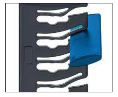
Lean separators enable extremely fast cable filling in several layers