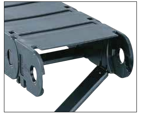
Half e-tube - fully enclosed along the outer radius. Openable along the inner radius on left or right