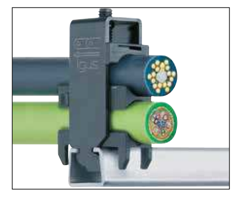
Strain relief e.g. clamps, tiewrap plates, nuggets, etc. ► From page 1300