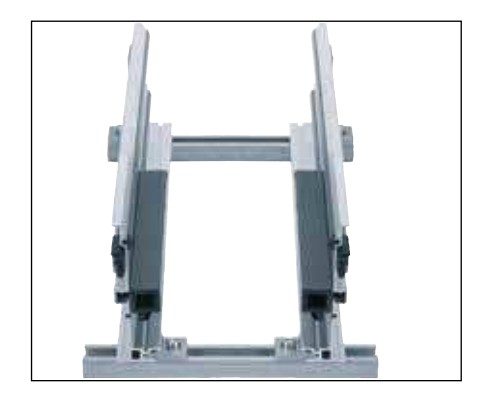
Aluminium SuperTrough - the standard igus® guide trough ► From page 1208