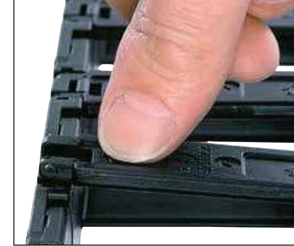
Fast closing by hand - secure without additional locking devices