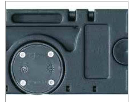
rol e-chain® E2/000 - rolling instead of gliding. Reduce driving force