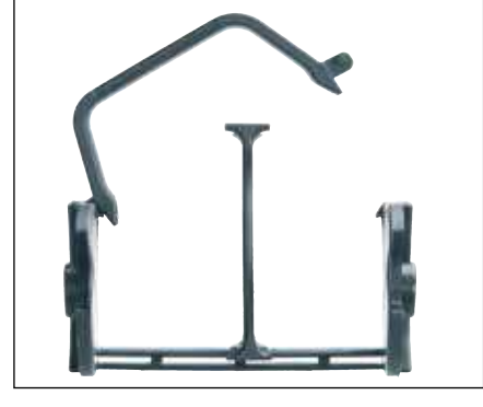
e-chains® with extender crossbars - large increase of the interior space