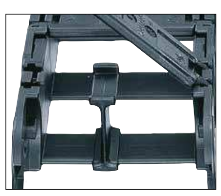
Separators are secure even when e-chain® is open