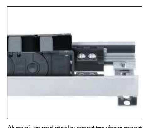
Aluminium and steel support tray for support of the lower run ► From page 1264