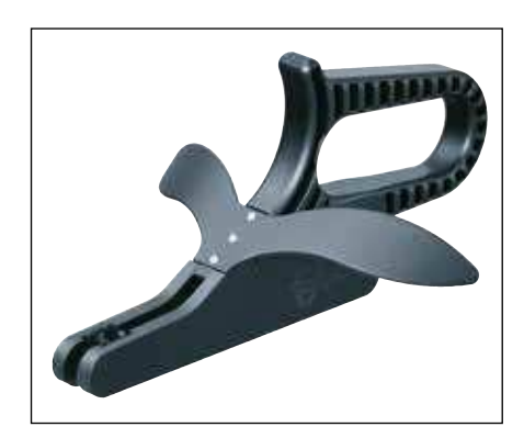
Open E2/000 in a flash with the e-chain® opener ► www.igus.eu/E2opener