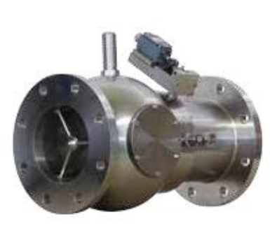
Stainless-steel float valve