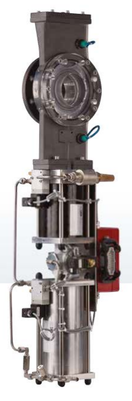
Fast-closing valve: closes within milliseconds

Both our passive and active decoupling systems and components slot neatly into your processes, reliably isolate the parts of your facility and, depending on the component, can be immediately redeployed after being triggered without any repair downtime or costs.