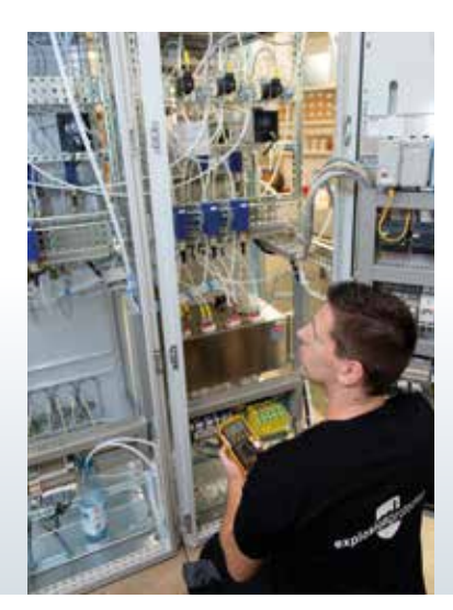
Calibration of an ACOM system

It is our ability to draw on our experience that sets our solutions apart from all others. This is based on a comprehensive knowledge and profound understanding of your processes.