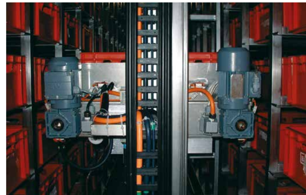
chainflex CF10 control cable in storage and retrieval units e-chain®: E2 system

Delivery time 24hrs or today. Delivery time means time until goods are shipped.